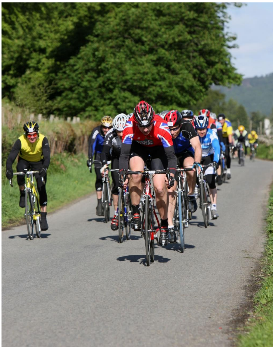
Eastbourne Rovers (in Union Jack) lead a large group of drafters

We're 35 miles in now and after passing a few more groups I'm with about 30 riders going pretty fast but they're not working together at all. I soon get fed up and decide it's better to go on the front and raise the pace than get a slow time. There's not a single rider will take a turn and if I drop off the front the pace just slows down.