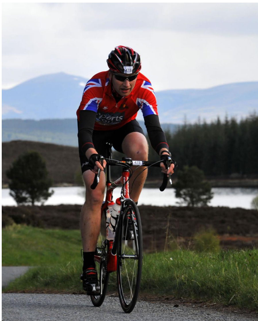
Pushing up one of the many hilly loch-side passes

I'm mad now and into the steepest descent, a recipe for disaster. But this is awesome, running 45 -50mph and no cars. The confidence is growing, no worries about taking a big fall because I'm in the zone, body low, using both sides of the road to take the lines and stay fluid. Passing rider after rider, this Soloist is at full whack and descends better than it should with my novice skills. Then a marshall waving a flag and I'm glad he did because we're into a 180 turn from 40 mph. Now I'm back with the group of riders I dropped before the climb but this time I'm doing the drafting because my legs are gone. We've got about 15 miles to go so I stick with these riders because we're still going to get a good finish time. Before long it's 10 miles to go and I'm riding this road for the second time today because it's the one I took in to the start. The legs are coming back now and I push to the front of the group to raise the pace a little. There's a guy at the front trying to organise the riders into taking a turn each but they're pretty reluctant and one guy peels off every time he thinks someone is on his wheel. These guys are posturing for the best finish position, but none of us in this group are top 10 so it's a bit pointless. However, the speed is now rolling 26-28mph and we are only a few miles from the finish.