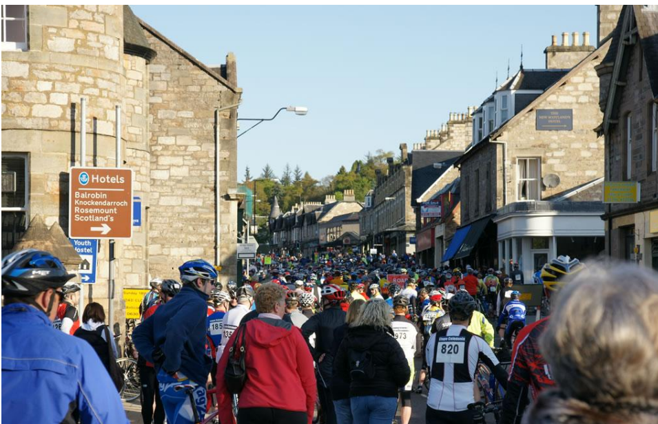
2,000 riders jam into Atholl Road, Pitlochry