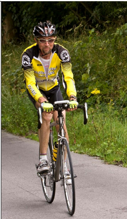
On Butts Brow, about 17% here!

I hope to report on this “adventure” next month!