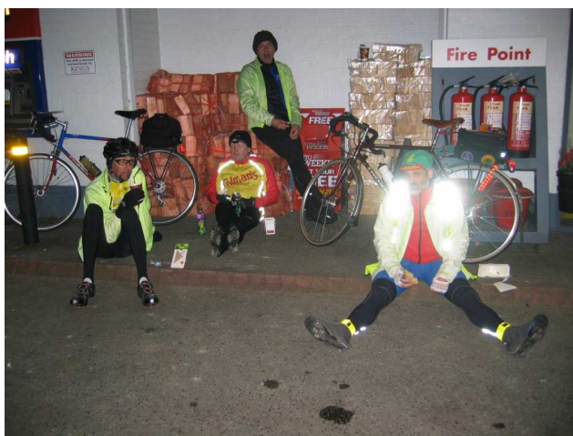
Slightly the worst for wear, 5am at a garage stop at Beverley

We had scheduled to leave Cherry Willingham at 1am, so we only had about 1 hours rest after the meal, funny how the time goes so quickly. Out into the night, which was clear and cold, about 2 degrees above freezing. Into Lincoln to get a stamp at the Shell garage on the ring road, some 285km covered, only 16km overdistance. We now crossed the Lincoln bypass on a high bridge and headed for the Humber Bridge, on our way to the next control at Beverley. This leg of 77km saw us arriving at just after 5am. The photo above shows us slightly the worse for wear.