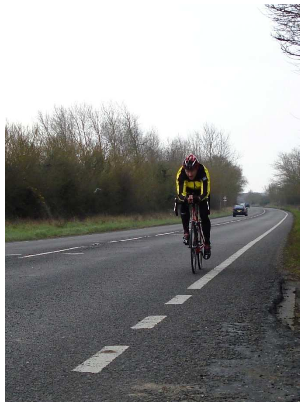
On a Road Bike!