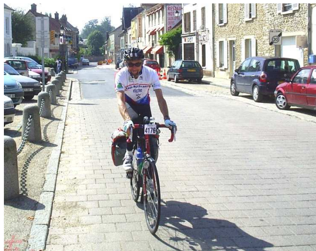
Returning from PBP August 2007 (in sunshine, hmm, I remember that!)

It was with some trepidation that I watched the weather forecasts throughout Friday 18 th April. The forecast for Saturday was, yes you've guessed it, RAIN FOR MOST OF THE DAY, JUST ALONG THE SOUTH COAST! My wife said that it would not improve no matter how many times I watched the forecasts throughout the day, she was right of course.