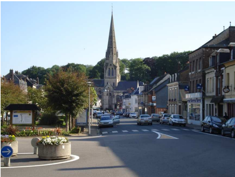
well earned beer?). The ride back was uneventful. Auffay -The town square viewed from hotel

We had a quick baguette at Torcy before pressing on and we arrived in Auffay early. After some Franglais with a couple of local passers by, I managed to locate the hotel which was not known to us and which appeared closed. The landlord, on hearing noises, came down and we offloaded panniers etc and then it was out on the road to Totes on