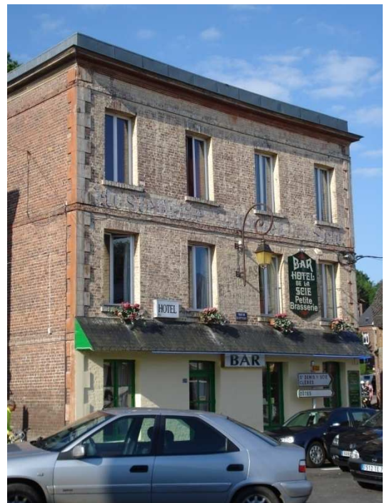
somewhat lighter bikes for a coffee (or was it a Hotel de La Scie, Auffay