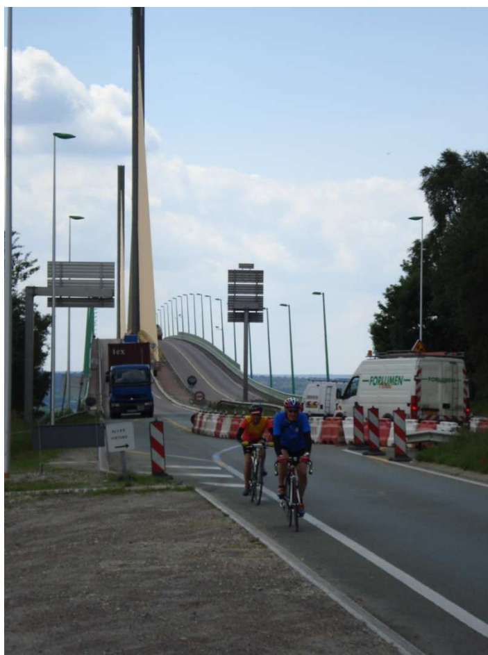
Alan & Stu having crossed the Pont de Brotonne

On arrival at the bridge the opposite lane was closed and, except for Stu who was last in the line and couldn't make us hear, we all missed the sign telling "Pietons" to cross into the closed lane. We all pressed on, and if you don't know the bridge prepare for a bit of a climb, to the centre. We also had to contend with the Routiers who were not happy at sharing the bridge with us and we weren't too happy with them sharing our lane either. Stu used the footpath but had to navigate round the signs which were placed there receiving cuts in the process. We regrouped un-nerved but unscathed and carried on to Caudebec to find a café on the riverside for lunch and watch the world go by.