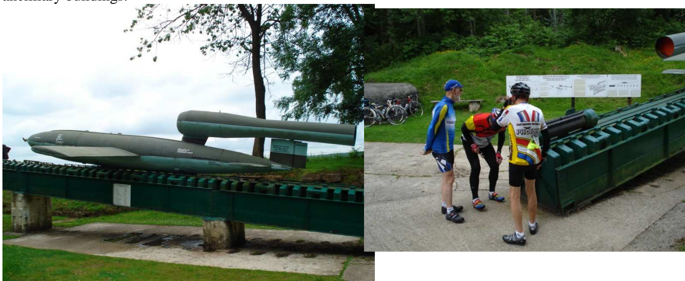
A "V1" aimed at London

On to the rocket site hidden in the forest, which still has the launch pad and V1 ready to go, together with ancillary buildings.