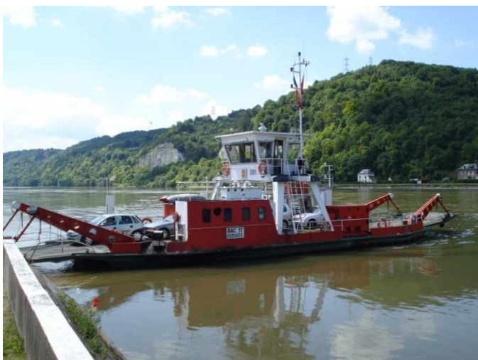
The ferry at Jumieges

At Jumieges we took the chain ferry (free of charge for bikes) over the river and proceeded along the other side.