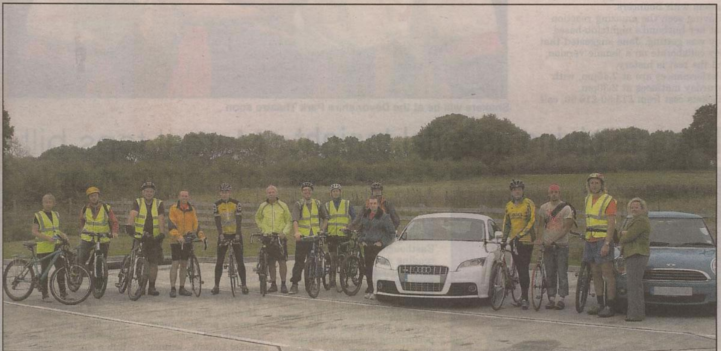
The riders, drivers and cars that took part in the race to promote a greener way to travel

A TOP Gear-style race between a bike and a car to mark to encourage greener forms of transport was won by.....the bike.